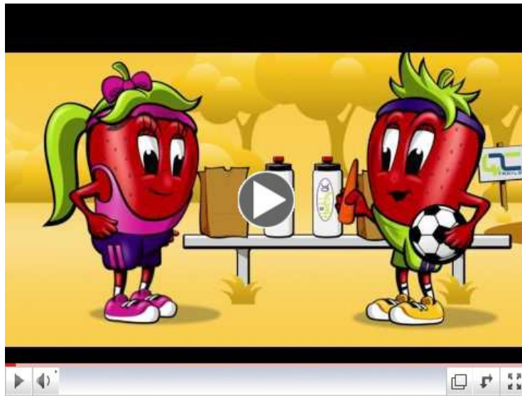
Making Healthy Choices with Skip and Scout

From moving more to eating veggies and drinking water, Skip and Scout love to make healthy choices. Learn more about how to eat healthy and move more at behealthyqc.org !