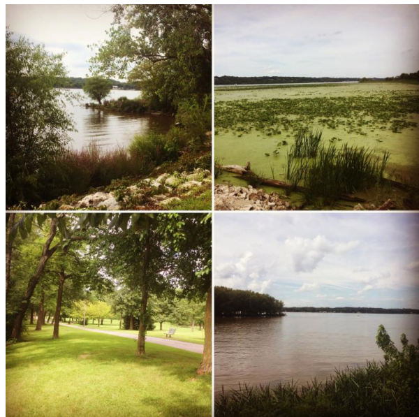
Enjoy views of the mighty Mississippi on the Great River Trail!

Visit QCTrails.org to learn more about this and other walking trails in your own neighborhood.