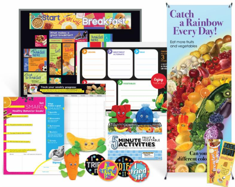
Examples of the materials now present in QC classrooms

Materials purchased for the students range from colorful and informative visual aids to booklets of 5 minute activities to interactive games and stuffed vegetable and fruit toys. With the reality of tightened budgets and reduced staff, our schools are delighted to have the opportunity to purchase these materials and use them with their students.