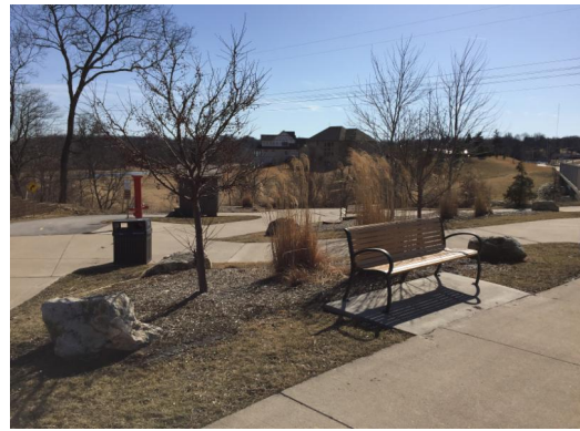
Take a break on a bench located along the sidepath

in the winter months. Bring your skates along for a fun experience at the new Frozen Landing Family Ice Rink in Middle Park. Visit QCTrails.org to learn more about this trail and others!